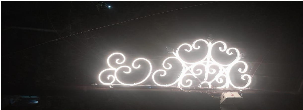
Length 6 Feet, Width 3 Feet